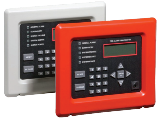
TR-RD1G / TR-RD1R