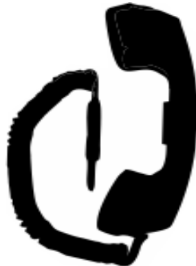
Figure 2 TR-RHS Fire Fighter's Remote Hand Set